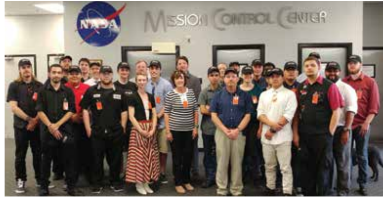
Lyn St. James joins RPM students at Mission Control during Shop Hop NASA.