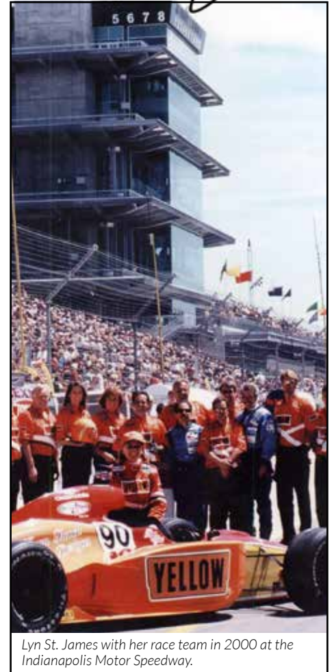
Lyn St. James with her race team in 2000 at the Indianapolis Motor Speedway.